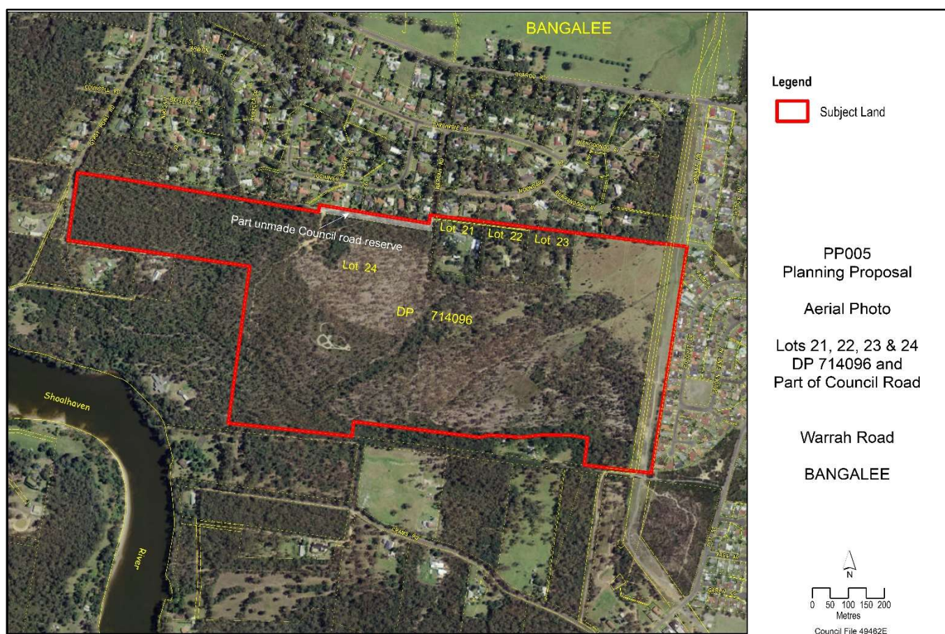
Figure 1 - Subject land and aerial photo

PP005 applies to: Lots 21 to 24 DP 714096 and approximately 300 linear metres of Council road at Warrah Road, Bangalee - See Figure 1.